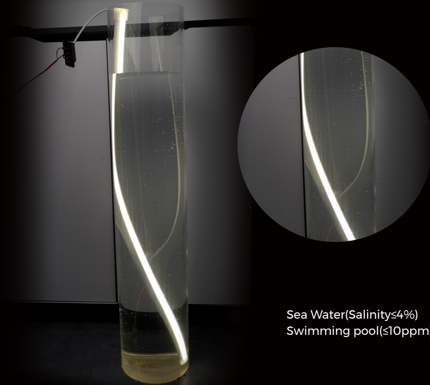
Sea Water(Salinity \leq 4%) Swimming pool( \leq 10ppm)