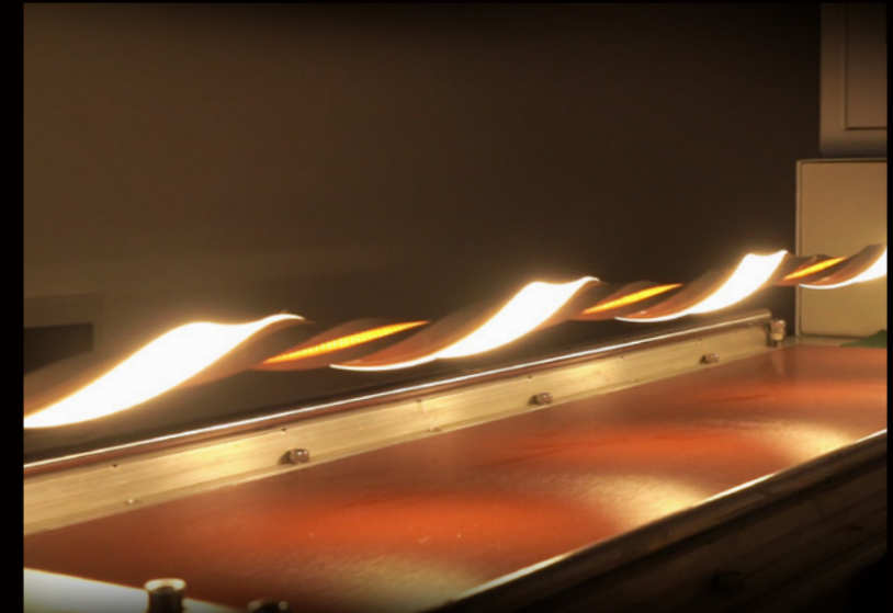
Twisting test * 720°*2000times