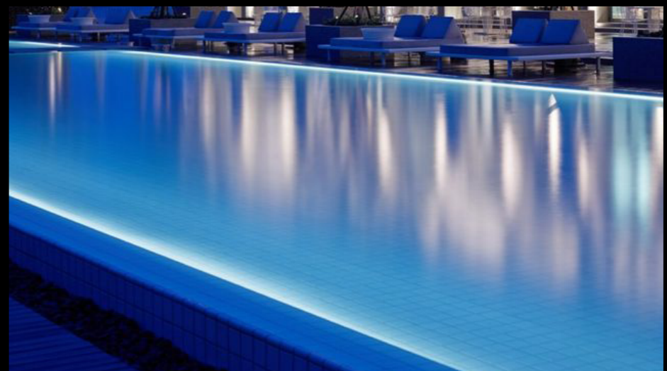
IP68, 3m deep